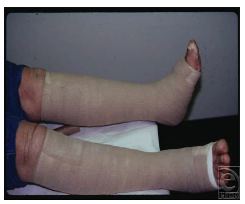
Figure 1. Compression bandaging using the 4-layer bandage system.

technician; a dedicated family member may be trained to appropriately apply the multilayer short stretch bandage system.